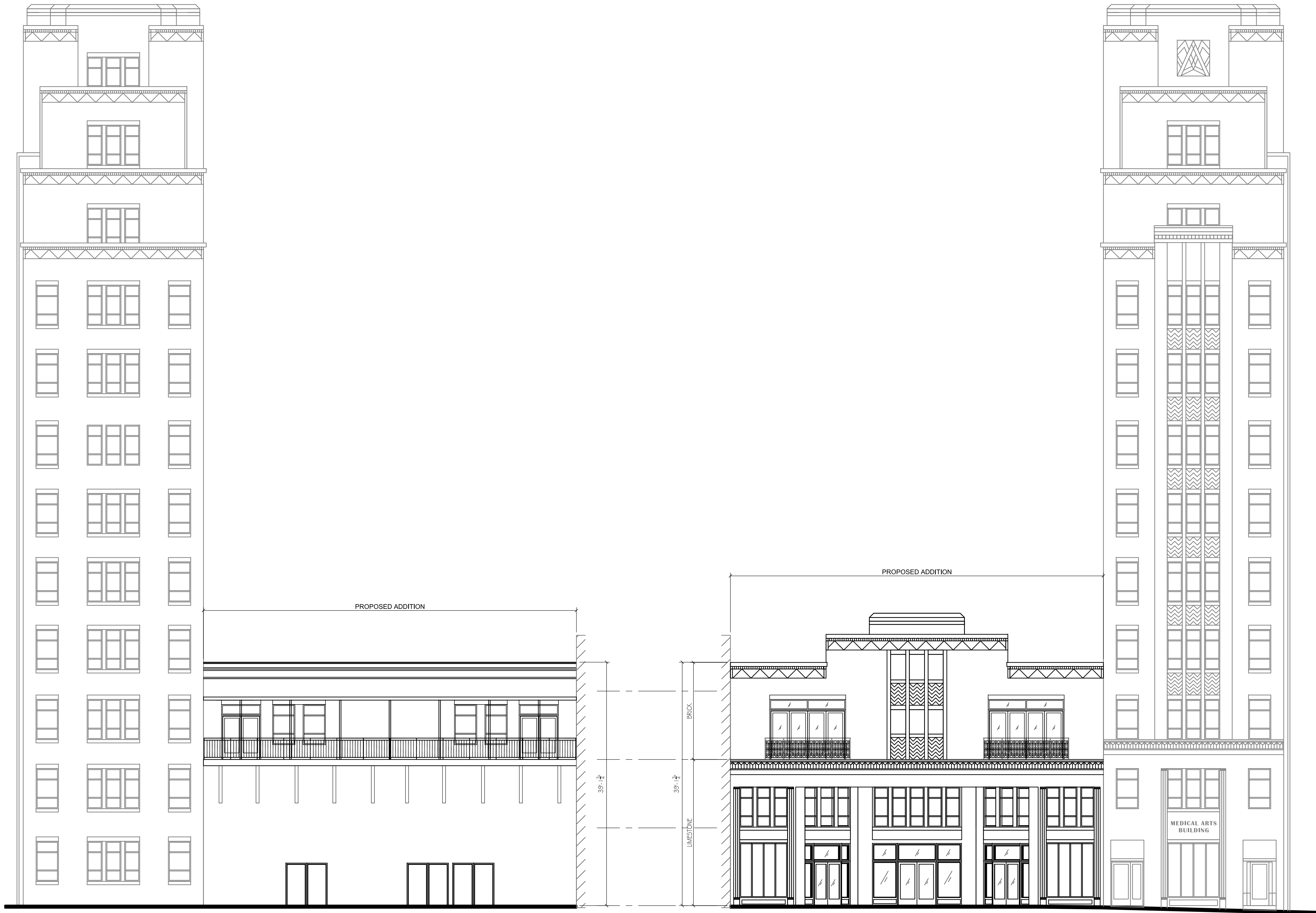
2 REAR ELEVATION 1/8" = 1'-0"